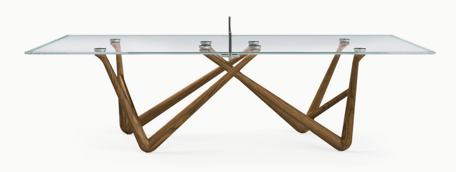
Table tennis with walnut legs