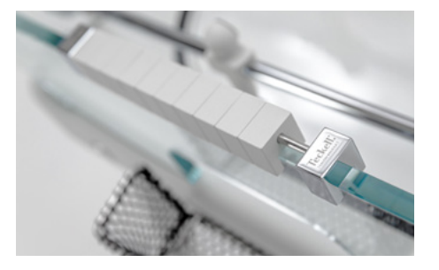
90° MINUTO INDOOR COVER Suitable for 90° Minuto